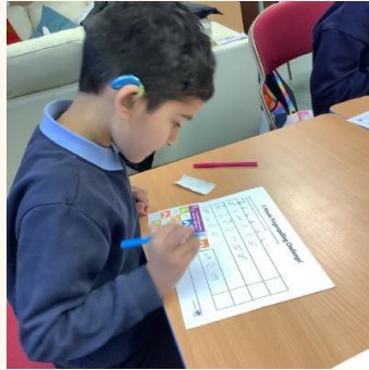
Deaf Friends Visit